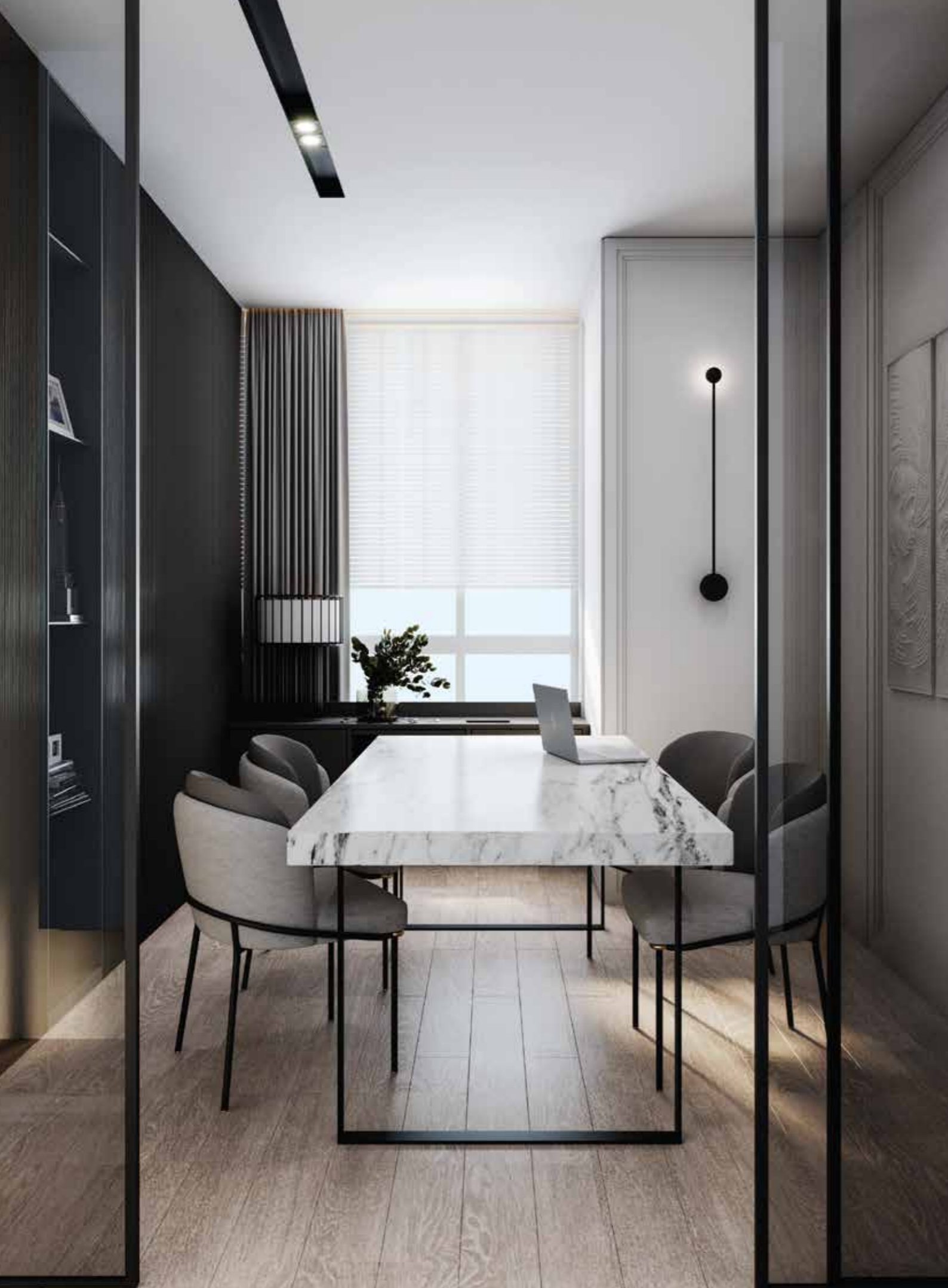
MEETING ROOM | ARTIST'S IMPRESSION